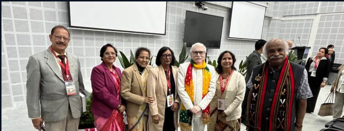
Reconnecting after years of professional journeys.