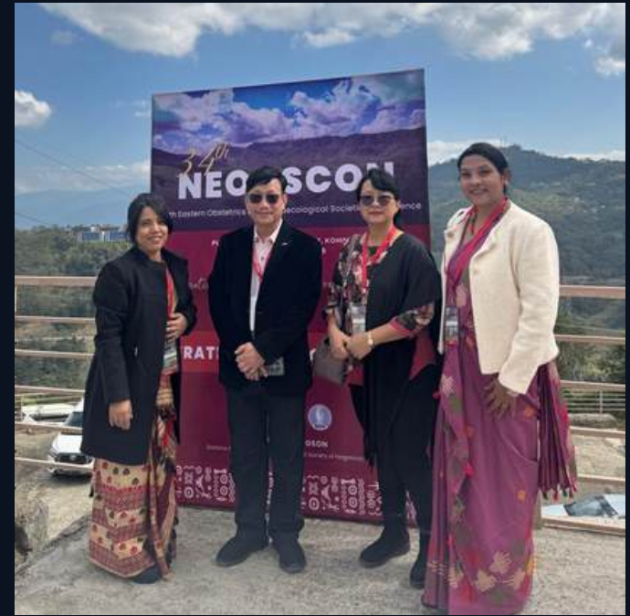
Smiles that bring warmth to the conference experience.