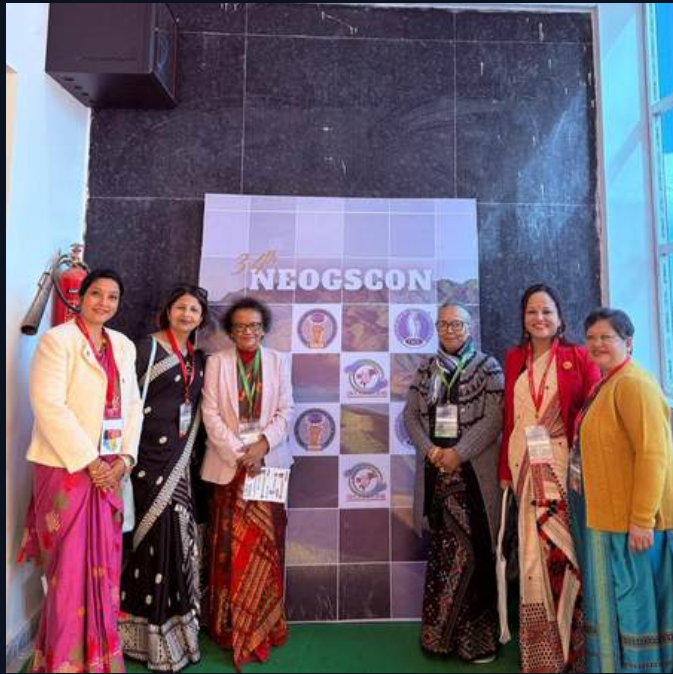
Quiet moments amid the bustle of academic sessions.