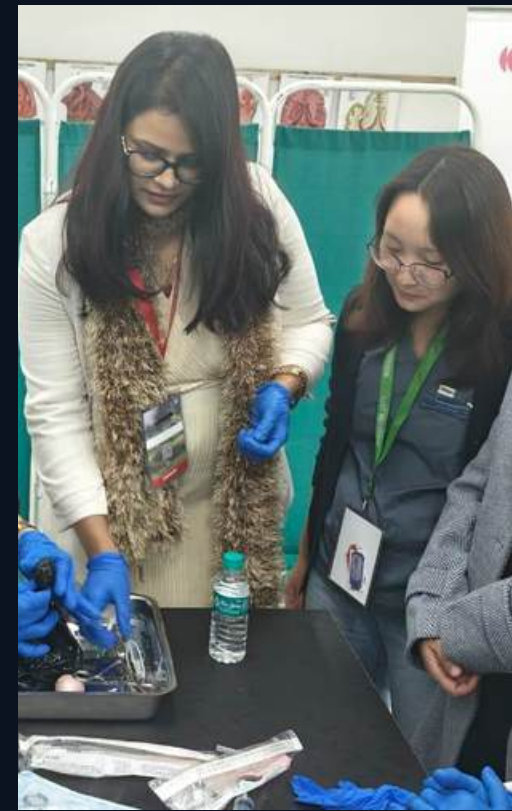
Clinicians exchanging perspectives, experiences, and solutions.